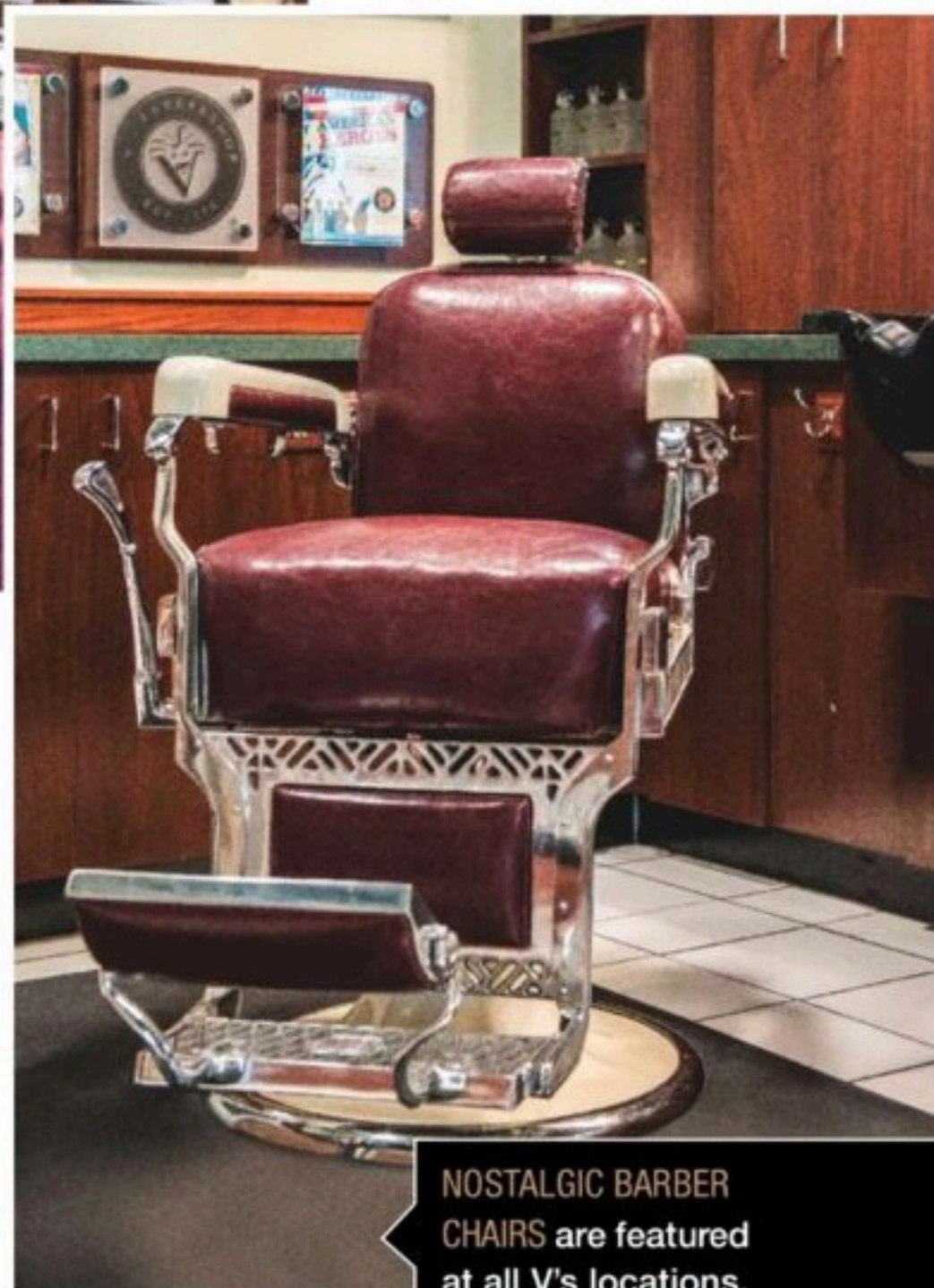
NOSTALGIC BARBER CHAIRS are featured at all V's locations.